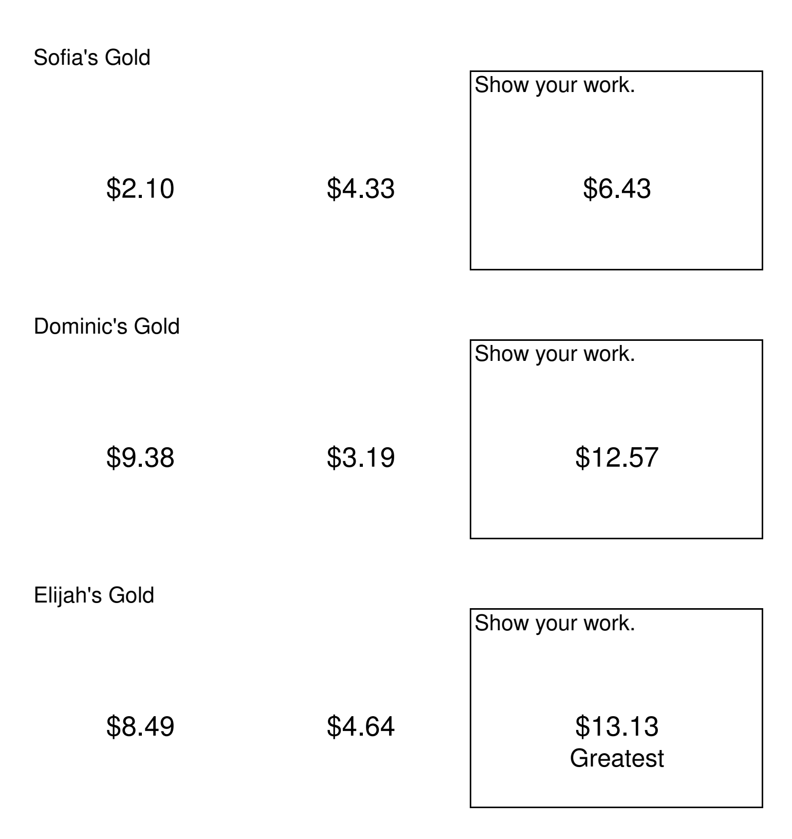
Happy St. Patrick's Day from http://www.math-drills.com

Instructions: Each friend found two pots of gold. Add the values of the two pots of gold. Who found the most gold?