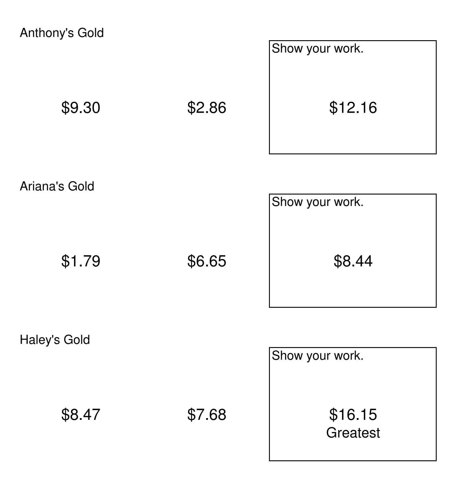
Happy St. Patrick's Day from http://www.math-drills.com

Instructions: Each friend found two pots of gold. Add the values of the two pots of gold. Who found the most gold?